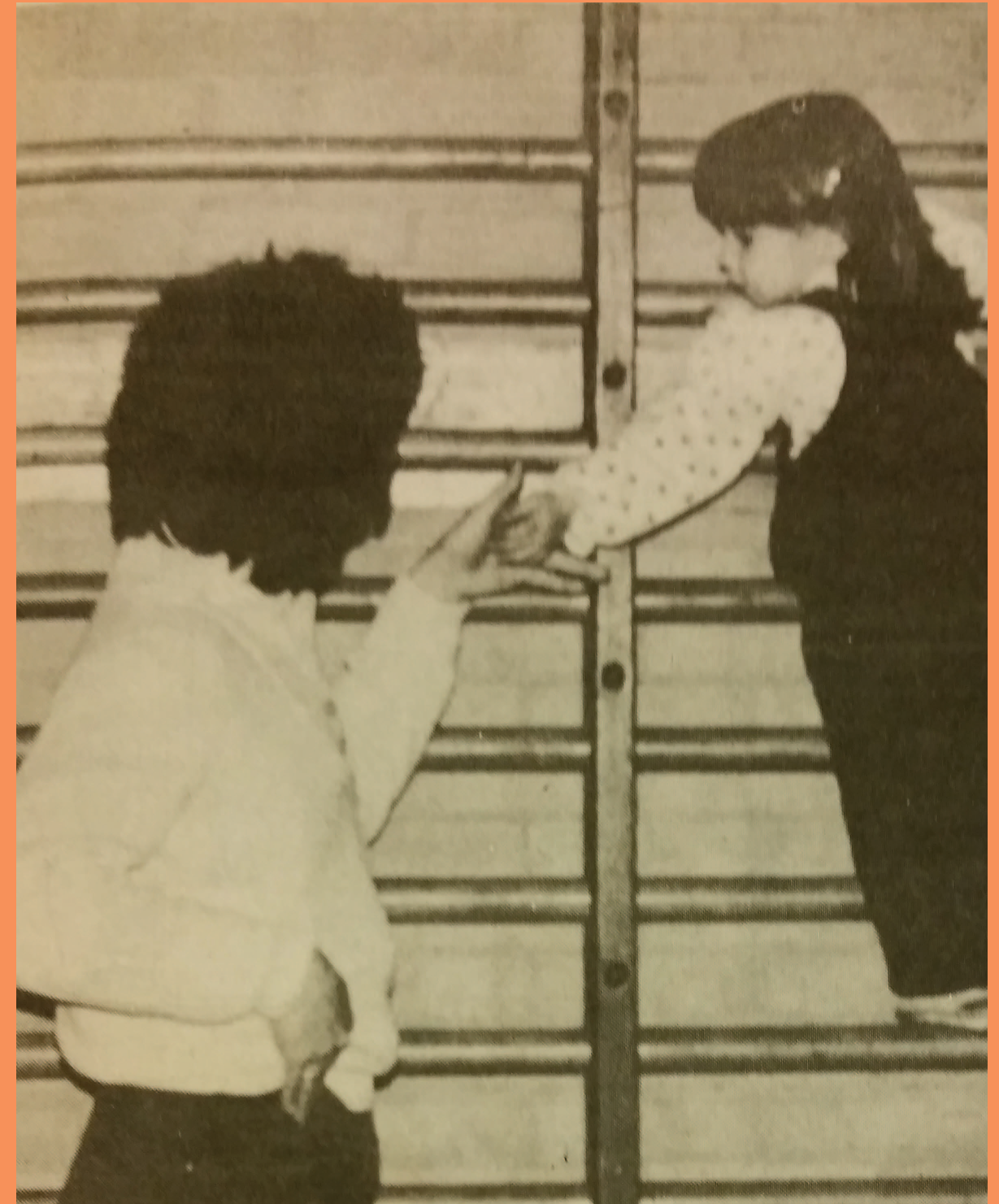
YWCA Play Time

A portrayal of girls partaking in dance and fitness. Celebrating Women's Health from The Standard Times, March 30th, 1984