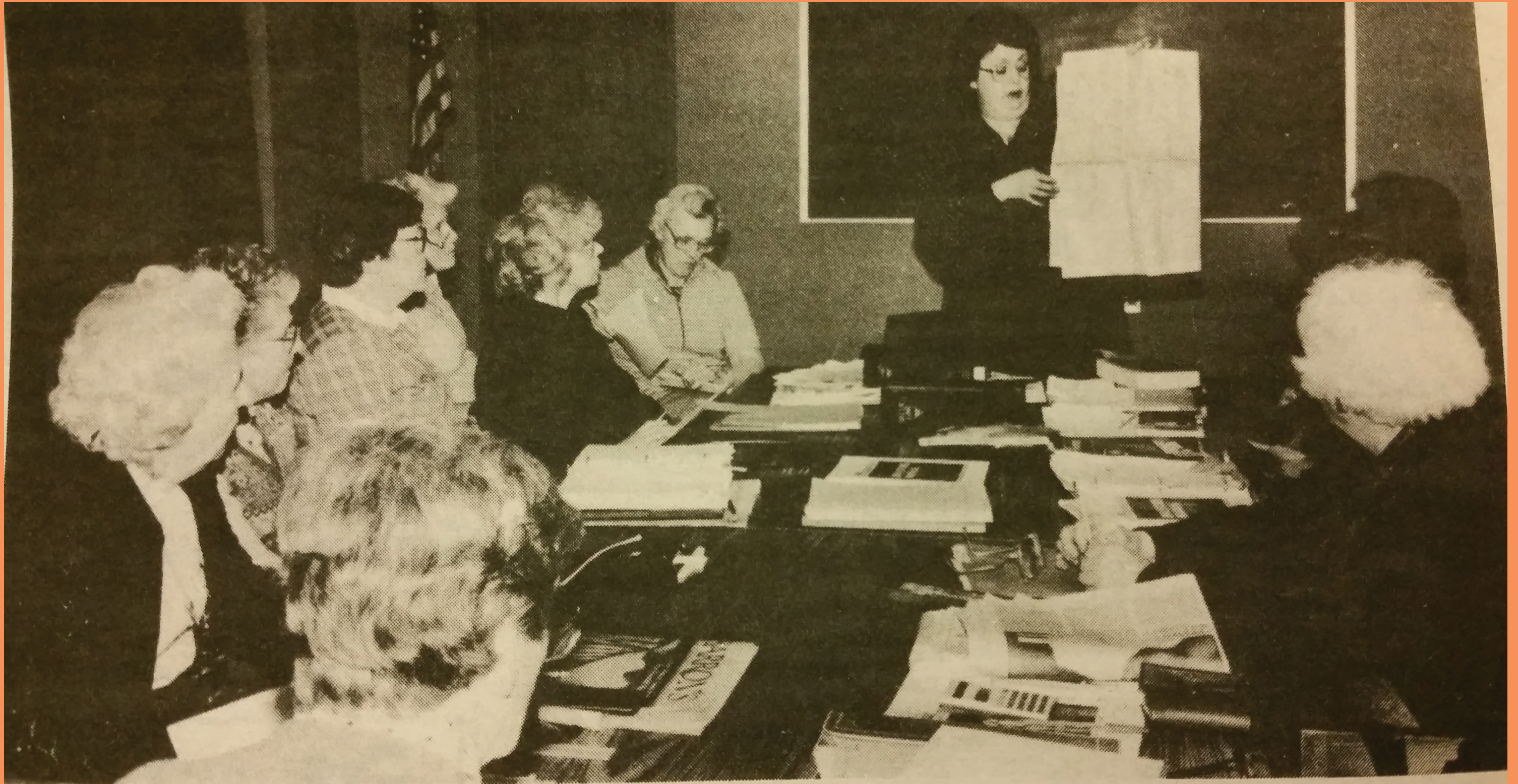
Investment Club Members for YWCA from The Standard Times, May 20, 1985

In maintaining with the mission of empowering women, the YWCA Southeastern Massachusetts provided the Investment Club as a way for women within the community to become educated and take part in investment practices.