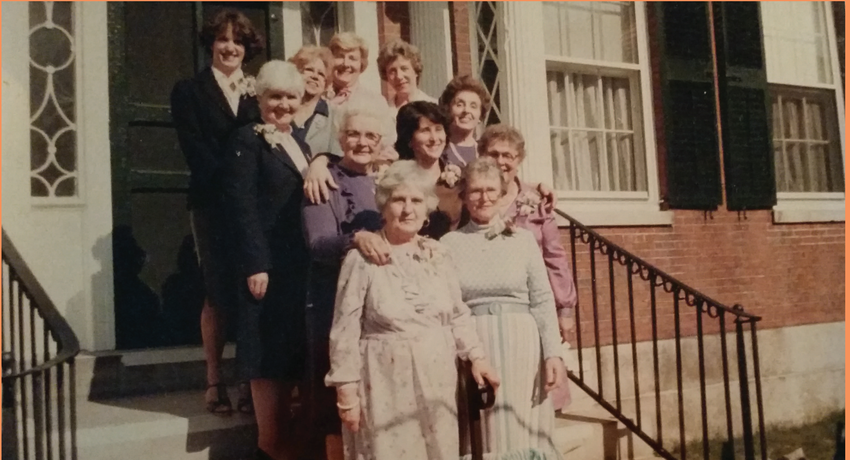
Leaders of the YWCA

The Board of the YWCA poses for a photo outside of the Levi Standish House. May 19, 1984