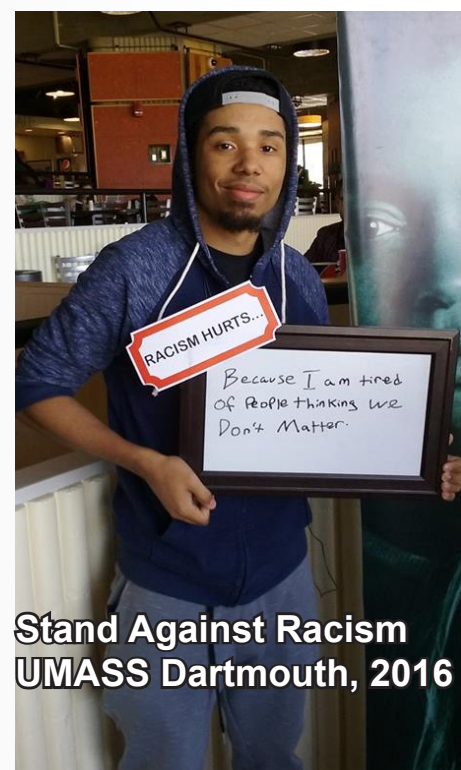
Stand Against Racism UMASS Dartmouth, 2016

“Mayor’s Youth Council,” is a teen advisory group that meets to provide input on mayor on issues of concern to their age group, attend civic functions, meet with representatives of city government to get and give perspective on community activities.