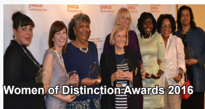
Women of Distinction-Awards 2016