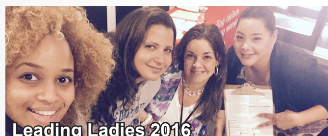
Leading Ladies 2016