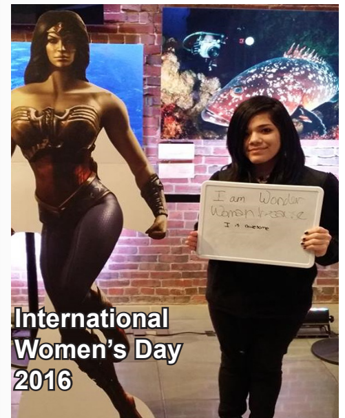
International Women's Day 2016