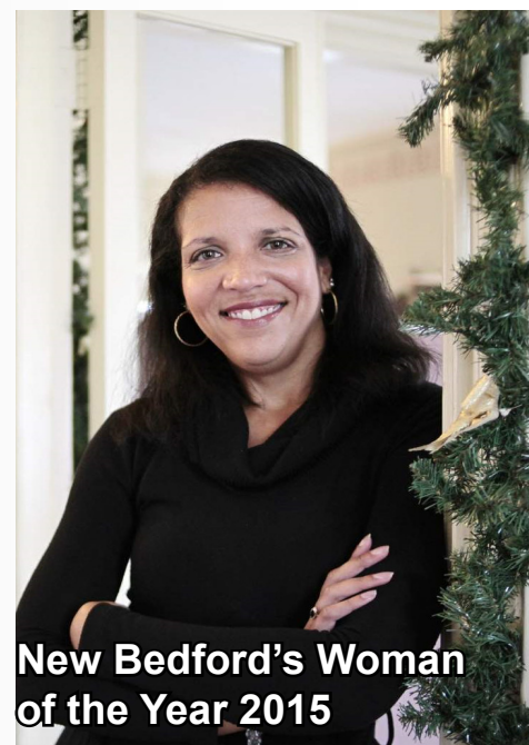
New Bedford's Woman of the Year 2015