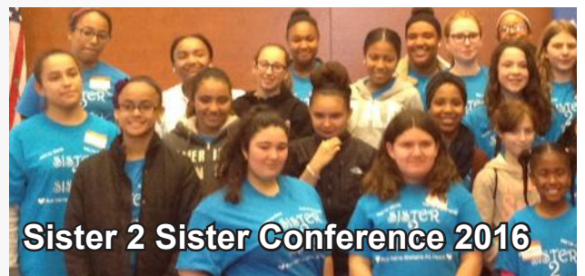
Sister 2 Sister Conference 2016