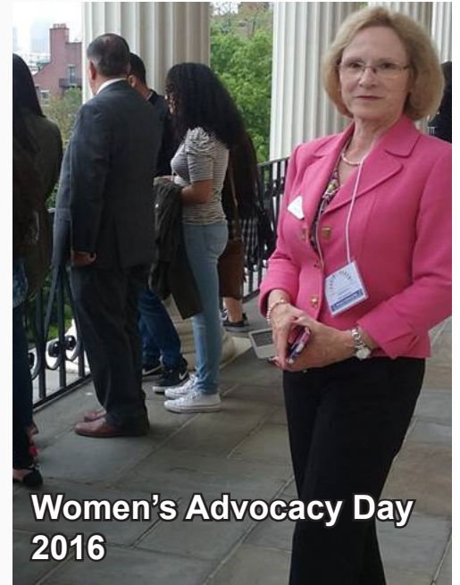
Women's Advocacy Day 2016