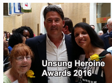
Unsung Heroine Awards 2016