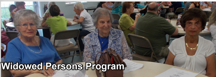
Widowed Persons Program