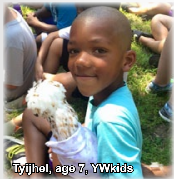
Tyijhel, age 7, YWkids