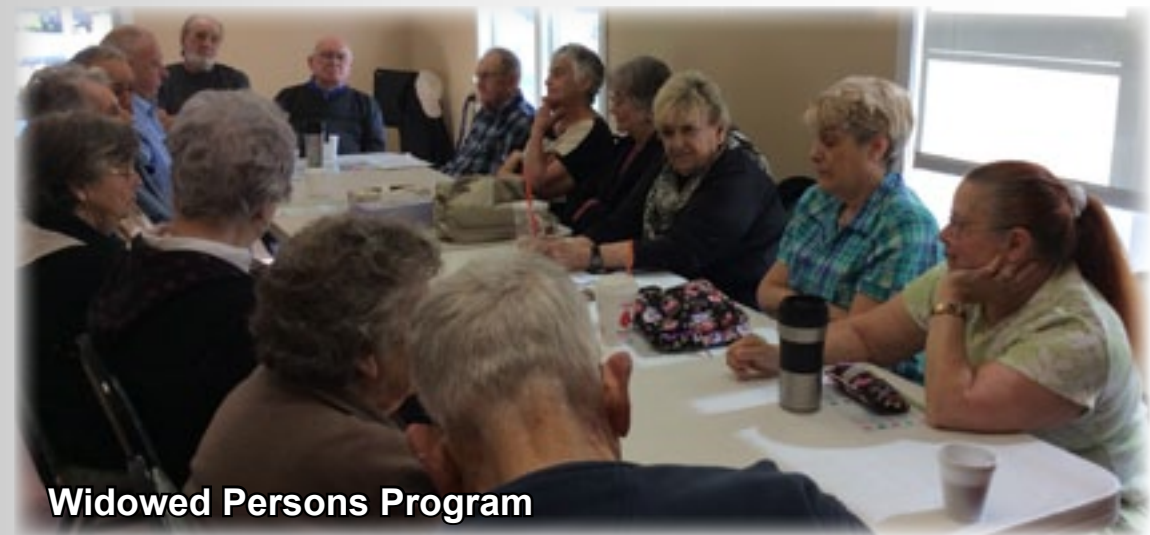
Widowed Persons Program