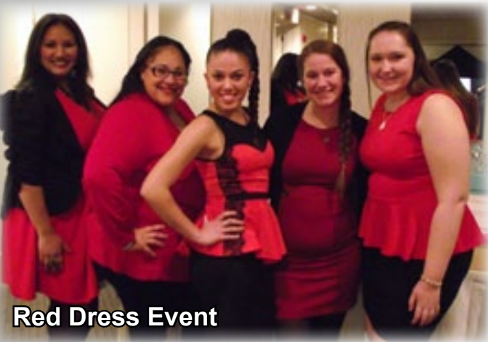
Red Dress Event