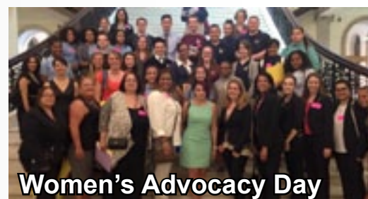
Women's Advocacy Day