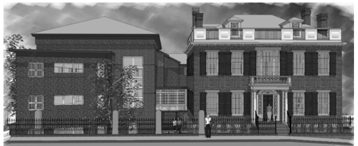
YWCA Levi Standish House of Tomorrow. Please show your support in making a pledge to the YWCA Under One Roof Capital Campaign.