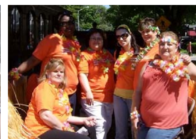
YWCA staff, board, volunteers, family, friends and children were out showing off their "persimmon pride" at the Cape Verdean Recognition Week Parade on July 5th.