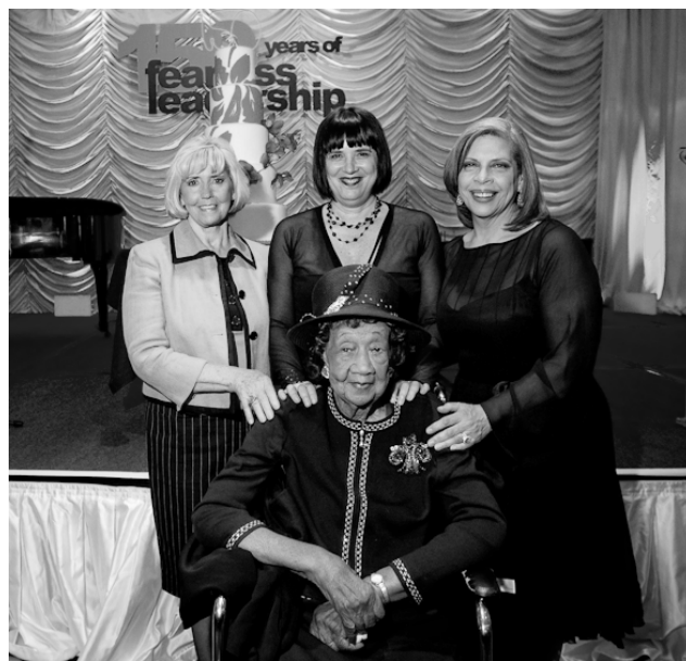
Above: Lily Ledbetter, Eve Ensler, Patti Austin and Dr. Dorothy Height

Fairness Act, Patti Austin the Grammy award-winning jazz singer, composer, and staunch activist against domestic violence, Eve Ensler, the internationally acclaimed playwright and author of "The Vagina Monologues" and Dr. Dorothy Height, who was the only woman standing on the podium during Dr. Martin Luther King Jr.'s famous "I Have a Dream" speech.