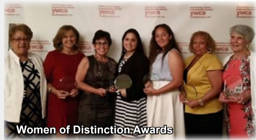
Women of Distinction Awards