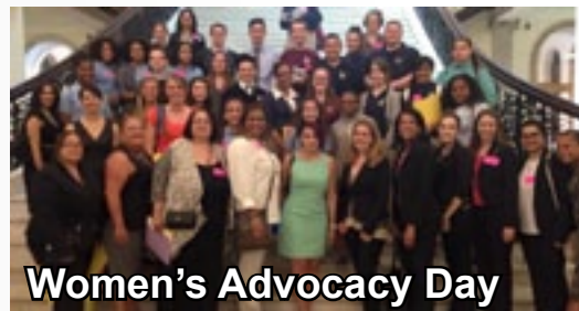
Women's Advocacy Day